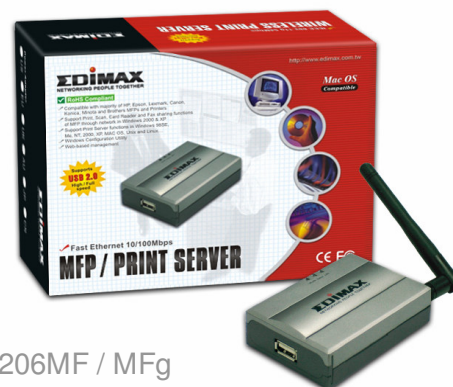
PS-1206MF / MFg